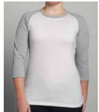
Haina Baseball Tee MW2030