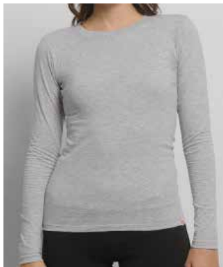
Himalaya Long Sleeve MW2020