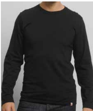
Skeena Long Sleeve MW1020