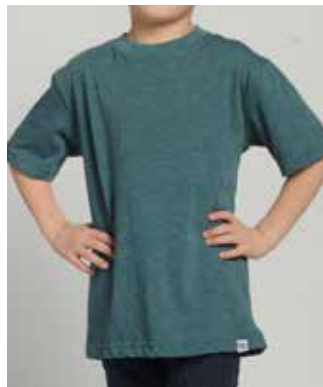
Zambezi Youth Tee MW8510