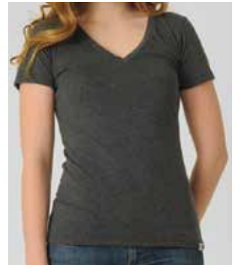
Zambezi Youth Tee MW8510