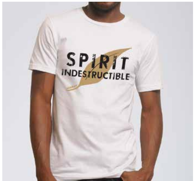
SPIRIT INDESTRUCTIBLE TEE