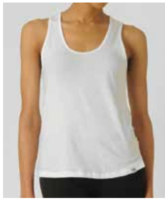
Delani Tank MW1080