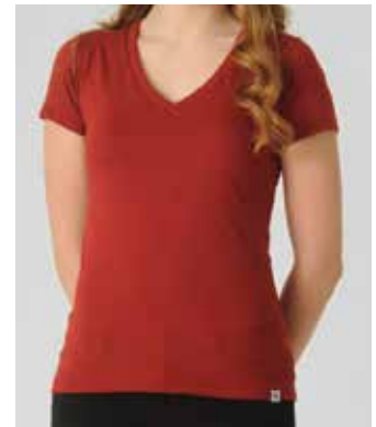
McKay V-Neck Tee MW2017