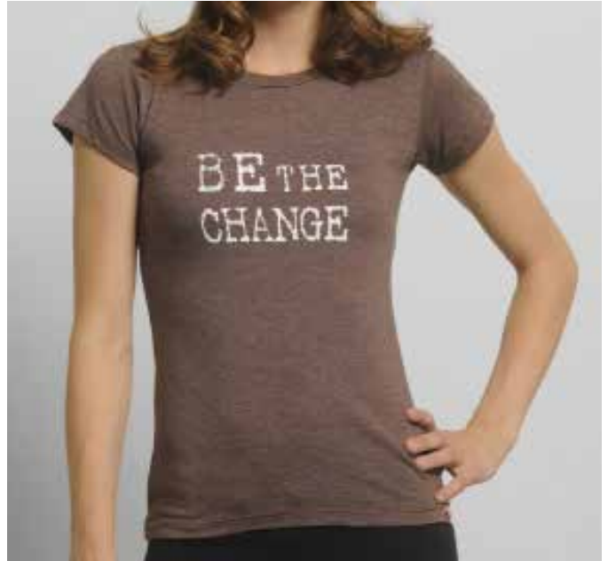
BE THE CHANGE TEE