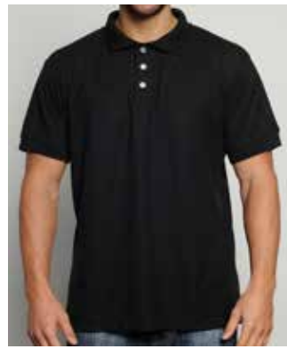
Everest Polo MW1470