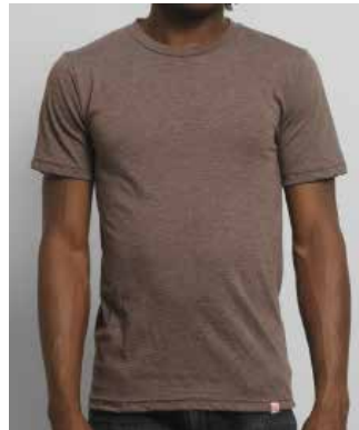
Indus Blended Tee MW1510