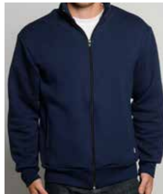
River Mock Neck MW1244