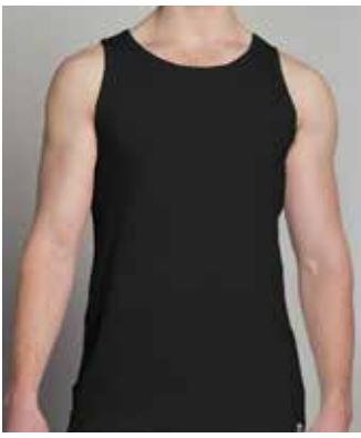
Delani Tank MW1080