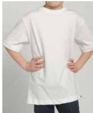
Makena Youth Tee MW8010