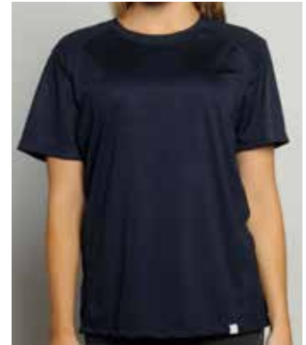
Kavu Performance Tee MW2710