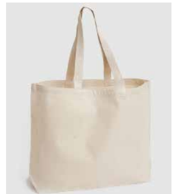
Canvas Bag MW6000