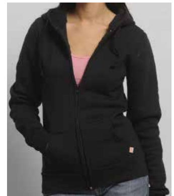
Lena Zip-Up MW2240