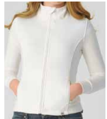
Okanagan Mock Neck MW2244