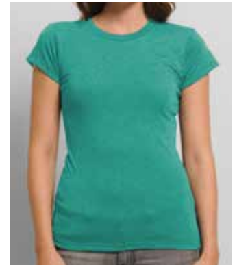
Nile Blended Tee MW2510