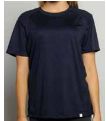
Kavu Performance Tee MW2710