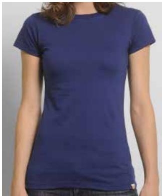
Sahara Jersey Tee MW2010