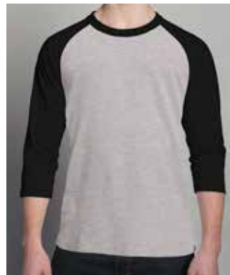
Bani Baseball Tee MW1030