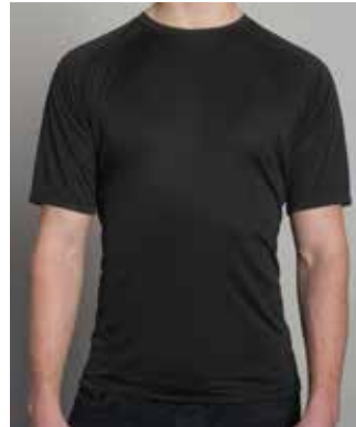
Jasho Performance Tee MW1710