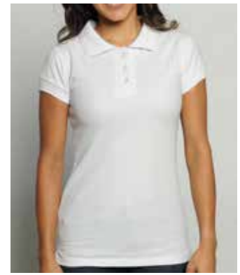
Fariview Polo MW2470