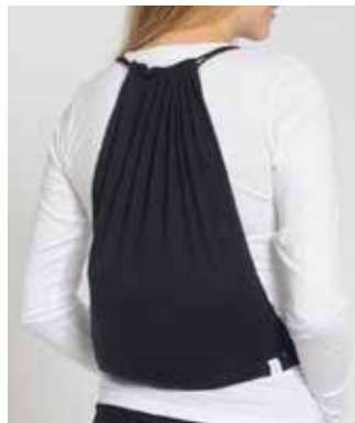
Drawstring Bag MW6010