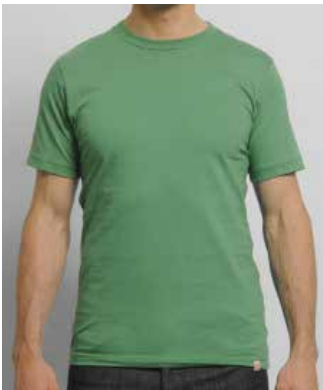
Amazon Jersey Tee MW1010