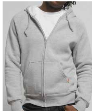
Appalachian Zip-Up MW1240