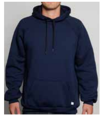
Hudson Hoodie MW3040